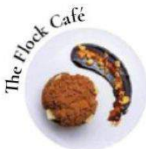
The Flock Café

◀ Another vegan restaurant that focuses on making healthy, plant-based dining options part of popular food culture. They also provide a variety of gluten-free options. The menu is a little pricey, but the food is incredibly tasty (love their turmeric chai and vegan burger!) and the cafe is decked with pleasant decorations.