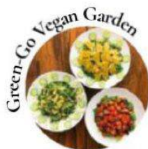
Green-Go Vegan Garden