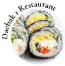
Dachak 1 Restaurant

◀ The Flock Café is one of several dining options at The Aviary Hotel and is known for great French pastries, as well as serving different choices of international and local dishes. I would say the best-selling point is that guests are able to customise their own salad and sandwich, making it easy to please everyone! My favourite pastry would have to be the vanilla puff. For my own wrap, I usually make it with avocado/veggies on a vegan pesto sauce.